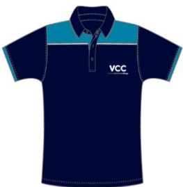
Polo Shirt $54.50