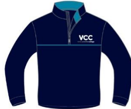
Rugby Top $55.95