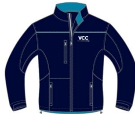
Soft Shell Jacket $116.95 (Optional)