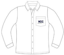
Long Sleeve Shirt $29.65