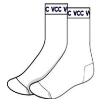
Socks $7.95 (Optional)