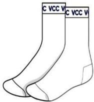
Socks $7.95 (Optional)