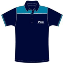
Polo Shirt $54.50