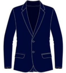
Blazer (optional) $183.50