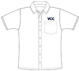
Short Sleeve Shirt $30.55