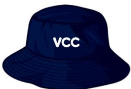
Bucket Hat $10.50