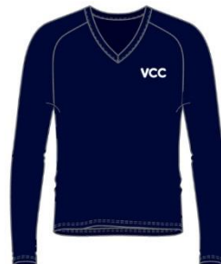
V Neck Woollen Jumper $84.50