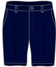
Dress Shorts $32.50