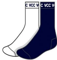
Socks $7.95 (Optional)