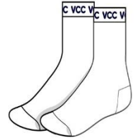
Socks $7.95 (Optional)