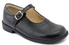
Black Leather Buckle or Lace Up Shoes (Example picture)