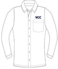
Long Sleeve Shirt $29.65