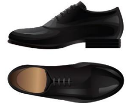
Black Leather Shoes (Example picture)