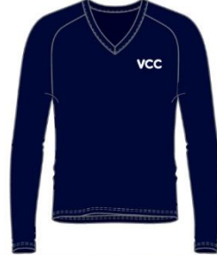
V Neck Woollen Jumper $84.50