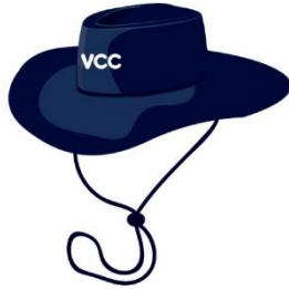
Wide Brim Hat $12.95