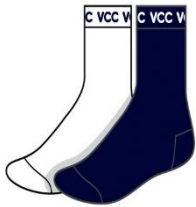
Socks $7.95 (Optional)