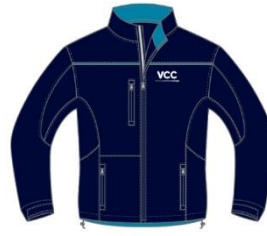
Soft Shell Jacket $116.95 (Optional)