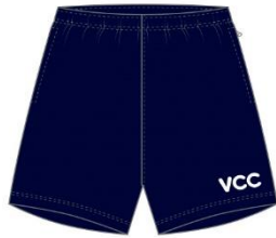
Capri Shorts $34.65